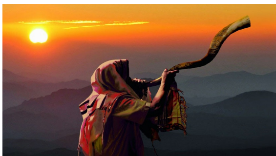
BLOWING A TRUMPET

and Benaiah and Jahaziel the priests blew trumpets continually before the ark of the covenant of God- See Benaiah for long list of men by this name.